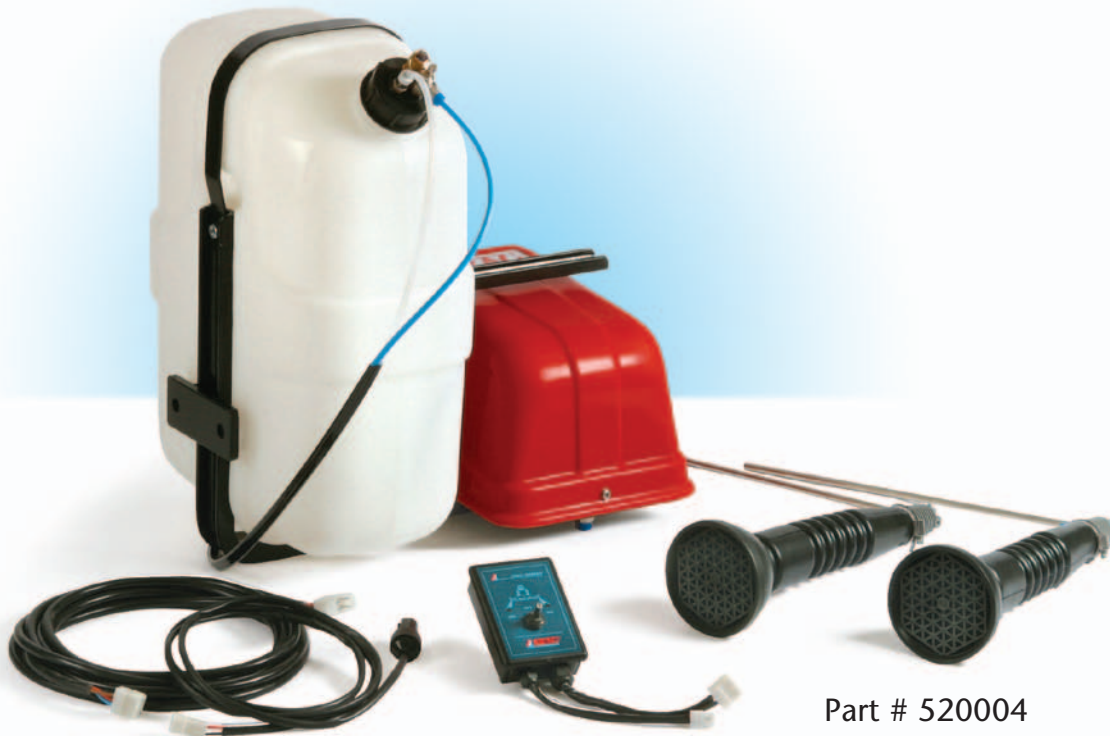
Part # 520004

Complete Kit for Turf and Row-Crop Sprayers